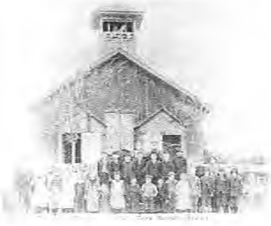
OLD ARENAC SCHOOL