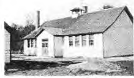
RIVERSIDE SCHOOL 1927-28