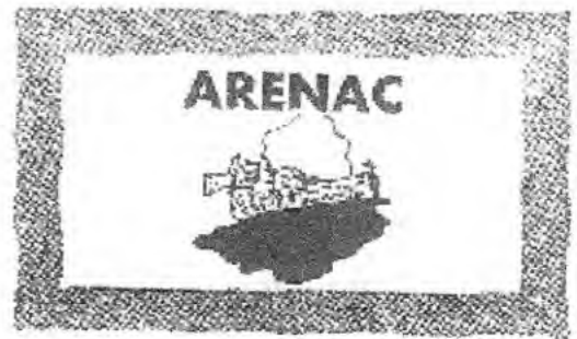
Arenac County Flag