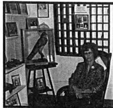
ENJOYING THE NEW ARENAC DISPLAY