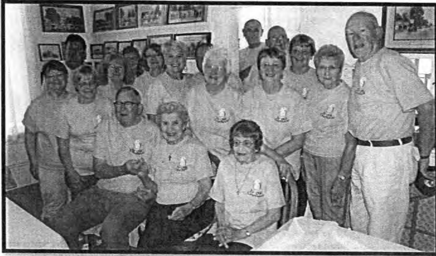
THE LOYAL COURTHOUSE "GANG" CELEBRATES THEIR HARD WORK

Through book sales, bake sales, junque sales and just plain hard work, the ACHS celebrated the paying off of the $85,000 mortgage on Ye Olde Courthouse in Omer on August 18 th . Many friends attended. They enjoyed listening to the history of the courthouse, the history of the purchase and paying off of the courthouse and the new display on Early Arenac. Here are a few pictures of the festive occasion.