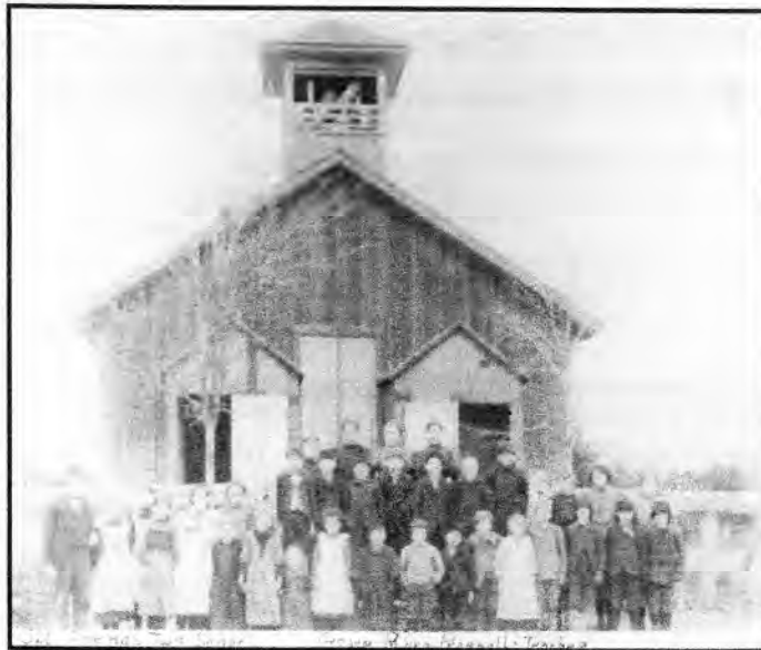
The old Arenac Township School

School's about to start again, drive carefully !